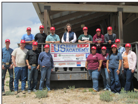
Congratulations to the USBA Class of 22!

The Academy receives corporate and industry support from several local, regional and national companies and organizations. It is a collaborative effort of NMSU Dept of Extension Animal Sciences and Natural Resources, Texas AgriLife Extension and the University Of Tennessee- Institute Of Agriculture, of which all three institutions provide faculty members. ■