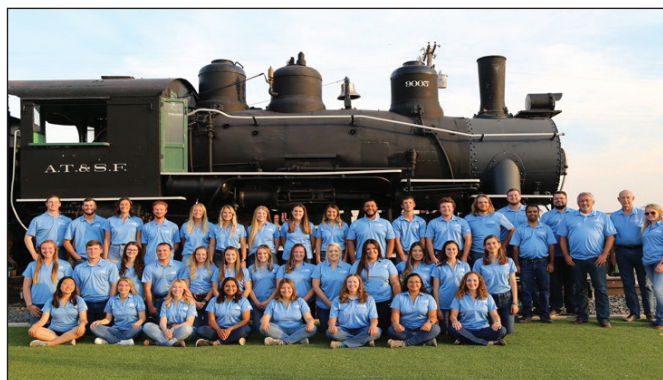
Dairy Consortium Class of '21