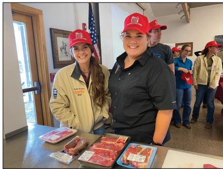
Learning about beef grades brings smiles to students.

capped at 16 students per year and in 2021, there were more applicants than roster positions. The 2021 student roster consisted of one veterinarian, three veterinary students, four graduate students (both Master's and PhD) and seven upper class undergraduate students. The students were from several universities and colleges including NMSU, Dine College, TX A&M, Colorado State and Oklahoma State. The Academy receives corporate and industry support from several local, regional and national companies that facilitate the delivery of the US Beef Academy. It is a collaborative effort of NMSU Dept of Extension Animal Sciences and Natural Resources, Texas Agri-Life Extension and Colorado State University.