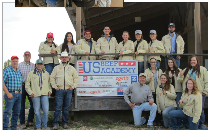
(below) Congratulations U.S.B.A. Class of 2021!