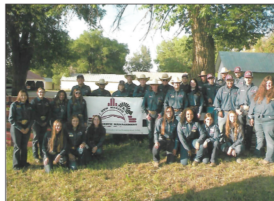
Students from all over the state participate in hands-on learning about ranching.

Collaboration between NMSU Extension specialists, county Extension agents and members of the ranching industry provide an opportunity for youth to learn about the many aspects of ranching through a hands-on curriculum on all things beef, marketing and economics, natural resources and range land management. ■