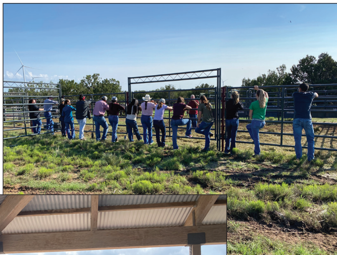
(above) USBA students evaluate cattle at the Corona Ranch.

T he United States Beef Academy (USBA) is an educational event for young men and women who are motivated to learn about the beef industry. This event is under the direction of New Mexico State University Department of Extension Animal Sciences and Natural Resources, and Texas Agri-Life Extension. It was designed to be a follow-up educational program for young men and women who have completed another New Mexico extension program, the NM Youth Ranch Management Camp. The US Beef Academy was formed to provide a unique, intense educational experience for the students that attend. The Academy's faculty are specialists in the Department of Extension Animal Sciences and Natural Resources, professors from the Department of Animal and Range Sciences and specialists from Texas Agri-Life Extension. The Academy is a five day, intensive educational opportunity for young men and women aged 18-21 years. This acad-