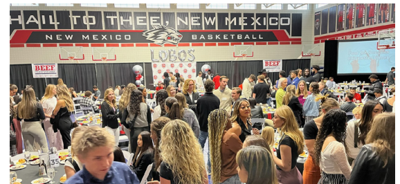
400 students filled the Rudy Davalos Basketball Center.