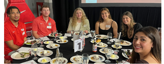
Smiling students enjoying their steak dinner.

Sports marketing has become an important focus for the NMBC. This banquet was the first effort targeting student athletes in higher education. The NMBC will be sponsoring a similar banquet at New Mexico State University in August for student athletes as they return for the fall semester. ■