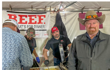
The tailgate party featured delicious beef from Rudy's.