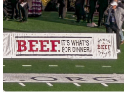
The NMBC logo was featured on the jumbotron and on the sideline.

The New Mexico Beef Council was a proud sponsor of the 2023 New Mexico Bowl on December 16 at University Stadium in Albuquerque. The 18th annual NM Bowl game featured the New Mexico State University Aggies of Conference USA, and the Fresno State Bulldogs of the Mountain West Conference. The game was attended by more than 30,000 fans and aired on ESPN. The NMBC was also a sponsor of the NMSU Alumni Tailgate party that took place prior to the football game with more than 1,500 Aggie fans who enjoyed Beef Brisket for their pregame meal. ■