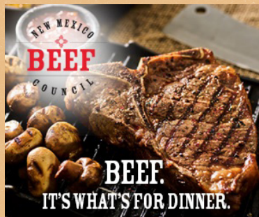
Sample ad from Lobo Athletics sponsorship