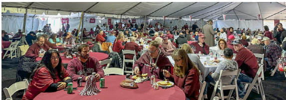
Hundreds of Aggie fans packed the tailgate tent.